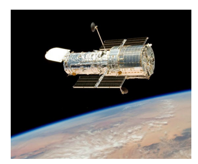
Hubble drifts over Earth

Our planet is a small blue sphere traveling through inky blackness. Enveloping that sphere is a wispthin layer of gases we call our atmosphere. The study of everything outside of that atmosphere – the Moon, Sun, solar system, stars and galaxies beyond – is astronomy.