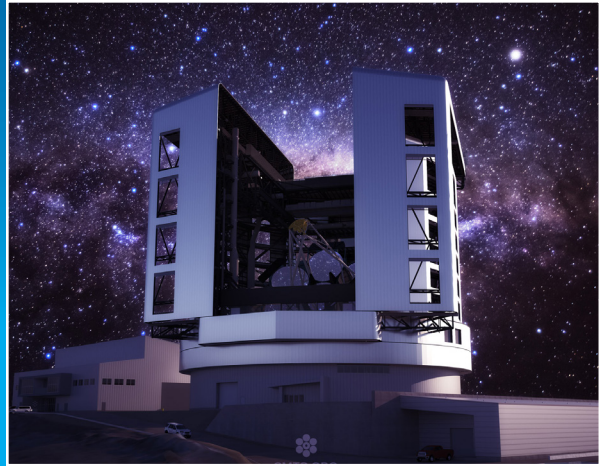
Artist renderings of two US led planned advanced extremely large telescope projects: top the Thirty Meter Telescope, bottom the Giant Magellan Telescope.